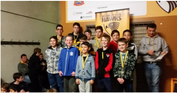
Round 8 Coaches Awards winners