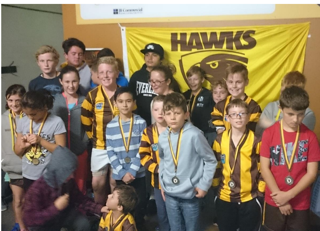
Congratulations to all our Round 5 Coaches Award winners.