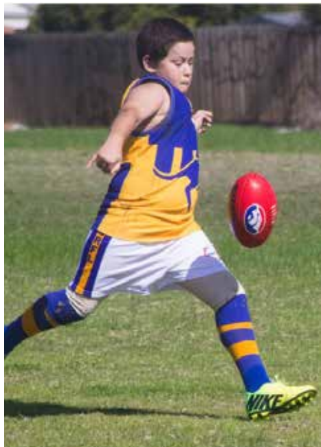
Check out this Sunshine Under 11s player executing a perfect drop punt.