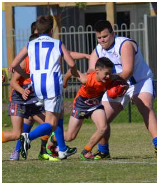
In a David vs Goliath type battle, the determination on this Manor Lakes Under 14s player is second to none!