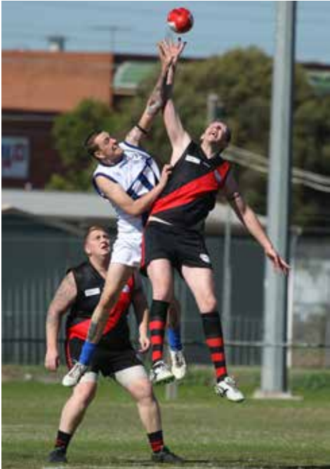
It was a tight tussle on Anzac Day down at Pennell Reserve, but it was Braybrook who eventually came up trumps.

In other results, North Footscray held off a persistent Caroline Springs by 24-points, while Glen Orden took full advantage of the wind when they had it, to account comfortably for North Sunshine by 62-points. Sanctuary Lakes had 137 reasons to celebrate over Laverton and Parkside showed the Tarneit Titans no mercy, winning by 222-points. At the going down of the sun, Parkside look like the team to beat, jumping to the top of the competition ladder with a healthy percentage of 829%. Round Four will see Parkside's next encounter against Sunshine Heights at home, while Wyndhamvale endure North Footscray in a second versus fourth place battle. Manor Lakes host Glen Orden while cross-town rivals Braybrook host North Sunshine at Pennell Reserve. Albanvale and Caroline Springs look to return to winning ways when they face off at Robert Bruce Oval,