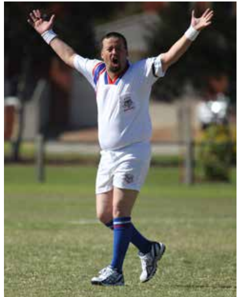
This WRFL umpire signals to all that it's play on.

Interestingly, from that game, AFL goal umpires who