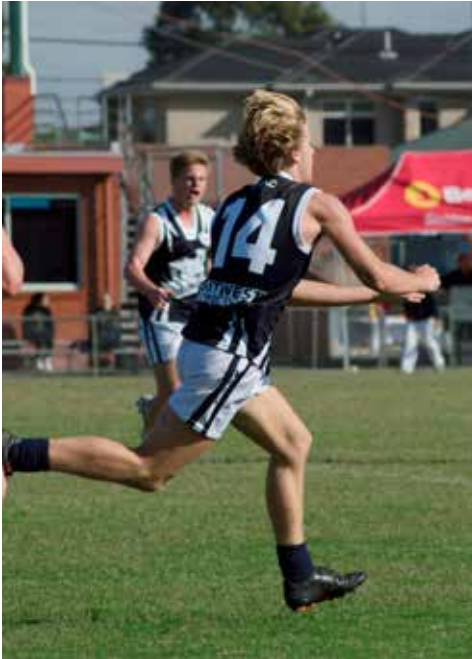
The reigning premiers were tested on the weekend, but managed to storm home against Spotswood to win by 22-points.