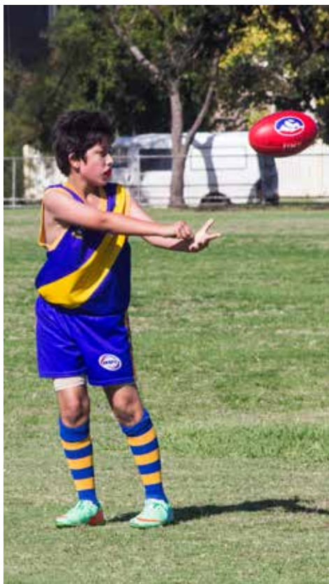
A terrific handball from this Under 12s Williamstown Juniors player.