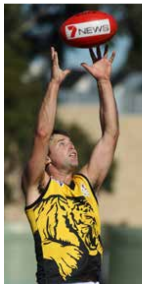
It seems Werribee Districts were in safe hands with this great overhead mark during their match against Sunshine last weekend.

they head to Hogans Road to play Hoppers Crossing, while Spotswood will look to bounce back from their big loss against a winless Albion. Two sides who grabbed their first win in Round 3 will also do battle as Werribee Districts host Port Melbourne and Yarraville Seddon face ladder leaders St.Albans.