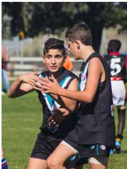
These Under 14 Newport Power players talk tactics before the next centre hit out in their match against the Suns.