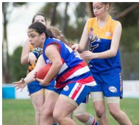
Point Cook Youth Girls enjoying their match against Deer Park last Saturday.