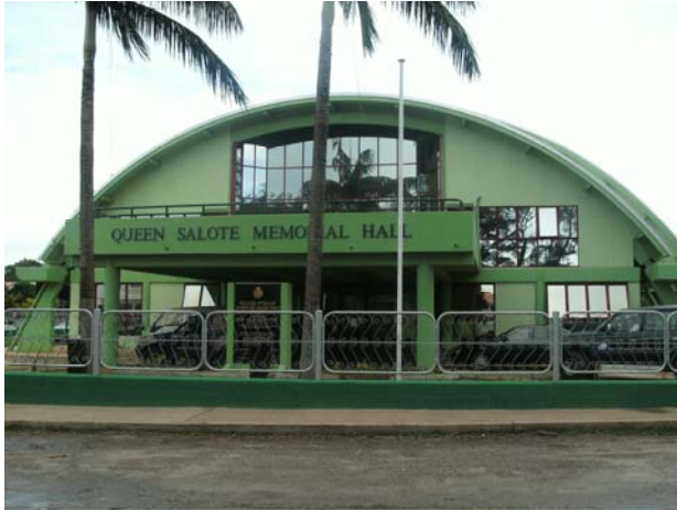
Queen Salote Memorial Hall

Meals will be served at the following four main dining halls.