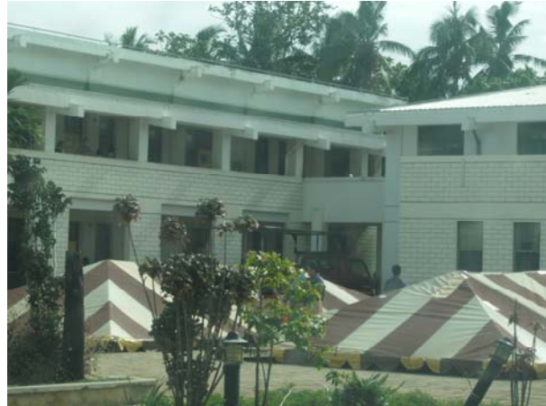
Queen Salote College