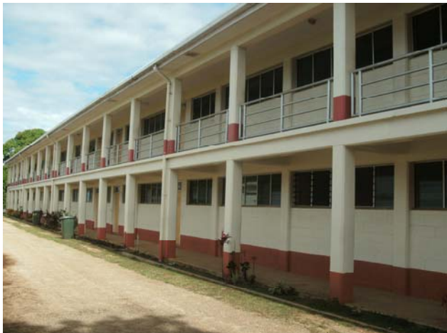
Tupou High School