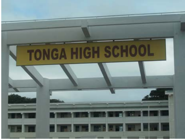
Tonga High School

Accommodation for official delegates and technical officials will be made in accordance to the arrangement stipulated in the Pacific Games Charter.