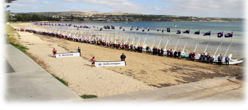
A Class with a great culture – 66 boats on the beach all with State flags flying

Australia is home of the Current World Champions ✓ YSA and ICCA supported coaching Active mentoring from successful older sailors Succession sailing : young crew eventually takes the role as skipper