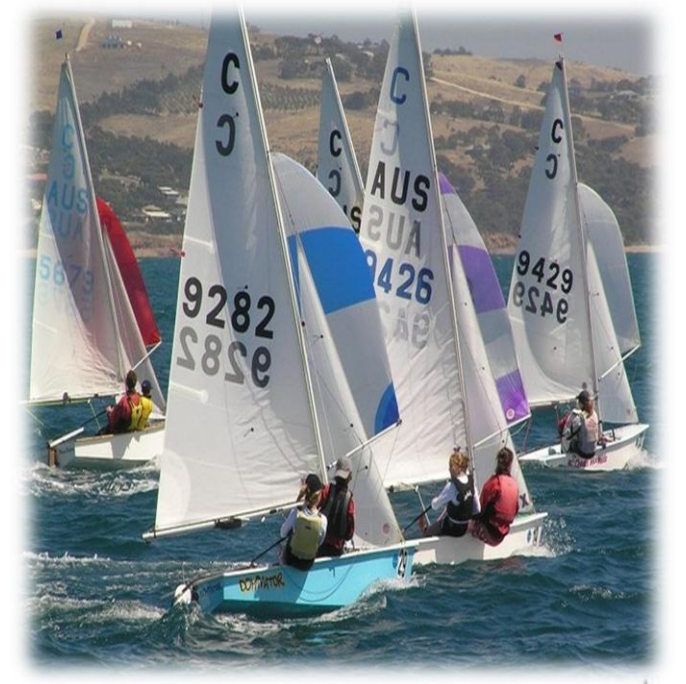
Easy and forgiving to sail