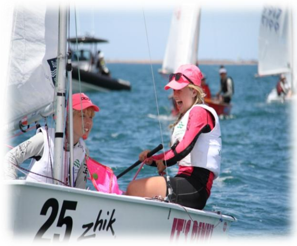
Two girls having fun

Only ISAF doubled handed Junior Class – 7 to 17 years International class sailed in 18 Countries over 4 Continents Perfect for a wide range of kids – optimal weight combo 85-110kg Ideal size and power: weight ratio for kids moving on from Optis A truly fun & friendly class , the parents have as much fun as the kids Easy to sail, simple to rig, an underpowered and forgiving boat