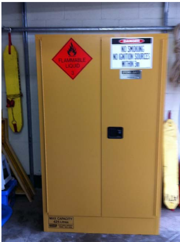
New Flammable Liquids Cabinet – purchased with the VESEP grant