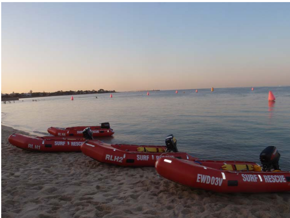
Perfect conditions for the set up of the Nissan Corporate Triathlon at Elwood February 2013.