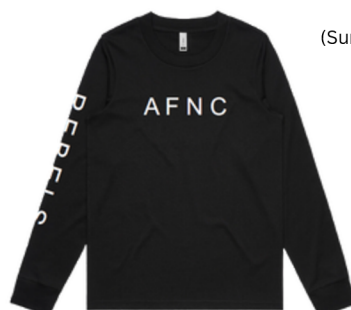
Long Sleeve Top

Long sleeve option available (additional charge)