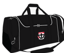
Sportsbag $50.00 each