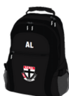
Backpack $50.00 each