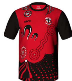
Warm Up Top - First Nations (Surname printed on the back)