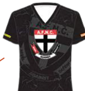
Warm Up Top (Surname printed on the back)