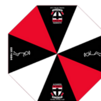
Umbrella $35.00 each

To place an order please email alexandrafnc@outereastfn.com.au