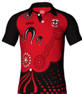
Club Polo First Nations