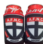
Stubby Holders $10.00 each