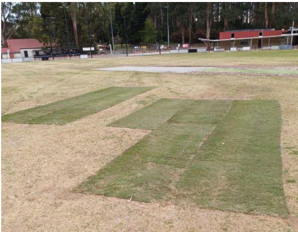
New grass has also been laid at the top end of the ground.