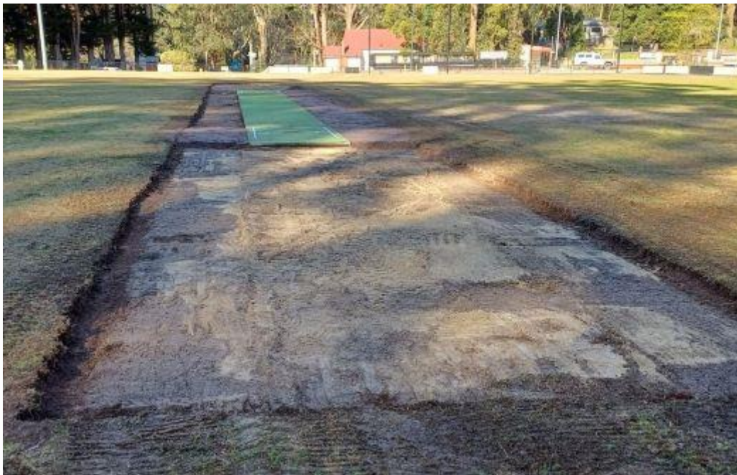
Artificial turf areas surrounding the wicket are being relayed

Meantime work has commenced on repairs to the centre wicket surrounds, which had seriously subsided in some places.