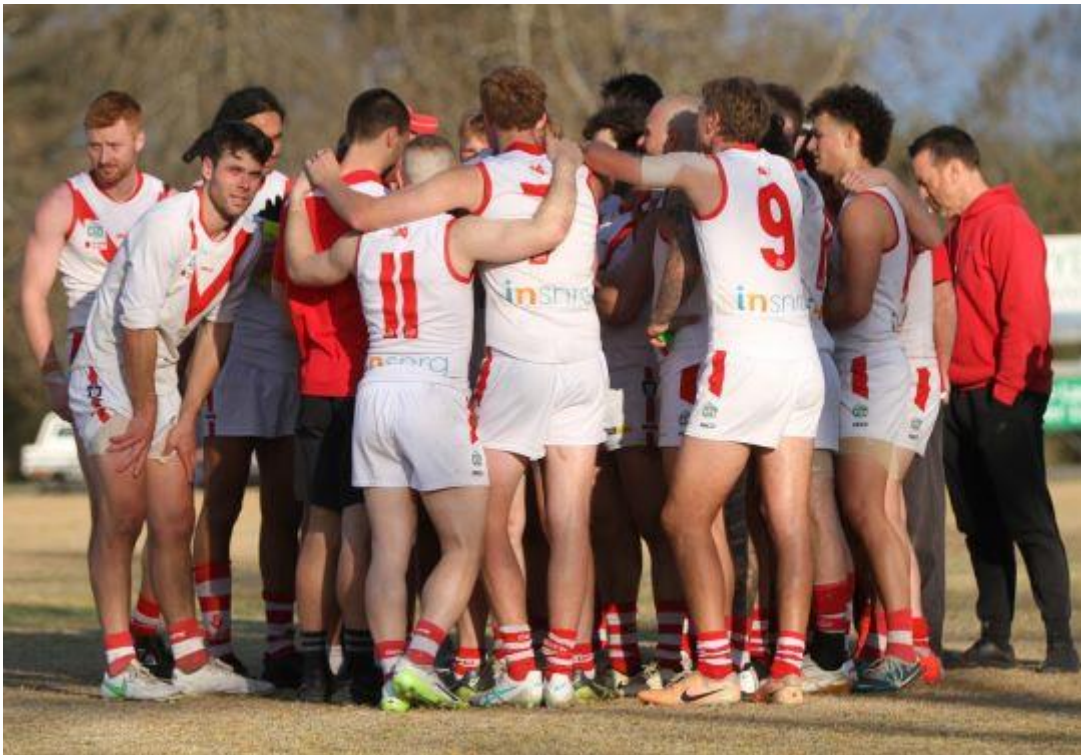
The end of a campaign that started in November last year

The one sided game starkly underlined the difference between the top three teams and the rest of the Outer East competition. However we are the "best of the rest" and that's compensation that can't be ignored as we come to terms with the pain of our loss.