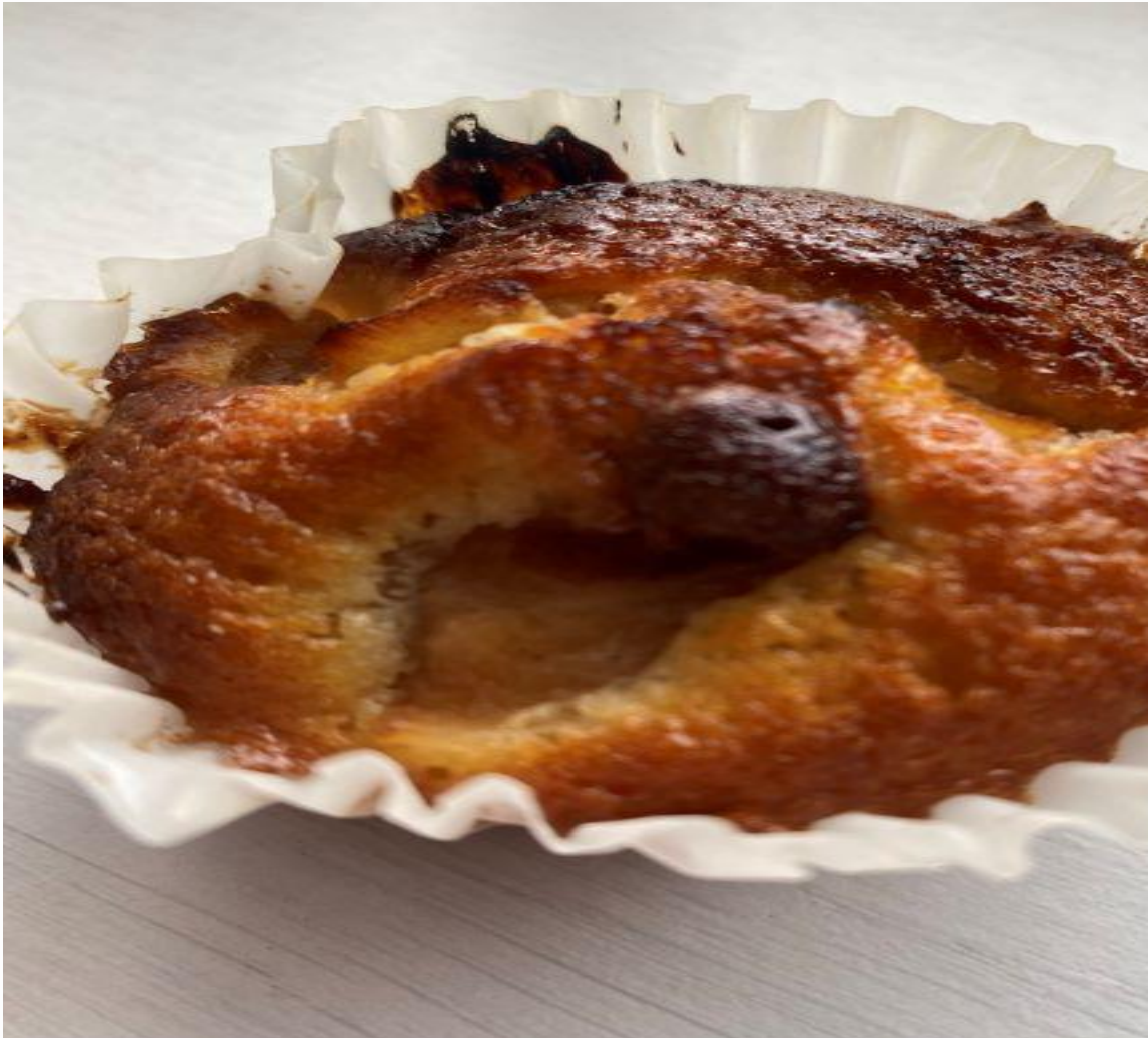
Strawberry and white chocolate muffin- courtesy of Trev Currie. Keep an eye out for these very special kitchen treats.

There is a caveat - if one of TC's batches comes your way- make sure you share them ! Take it from one who has tried- you won't be able to eat them all.