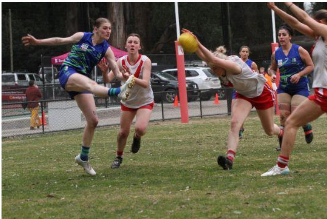
Turnover Time- OFC's defensive pressure was a huge factor in the win

We kicked 12.10 and held the visitors to just five behinds in front of an enthusiastic twilight footy crowd. It's interesting how quiet the Clubrooms were after the Senior's big win over Upwey because so many people are heavily invested in the women's footy and were outside watching the action.