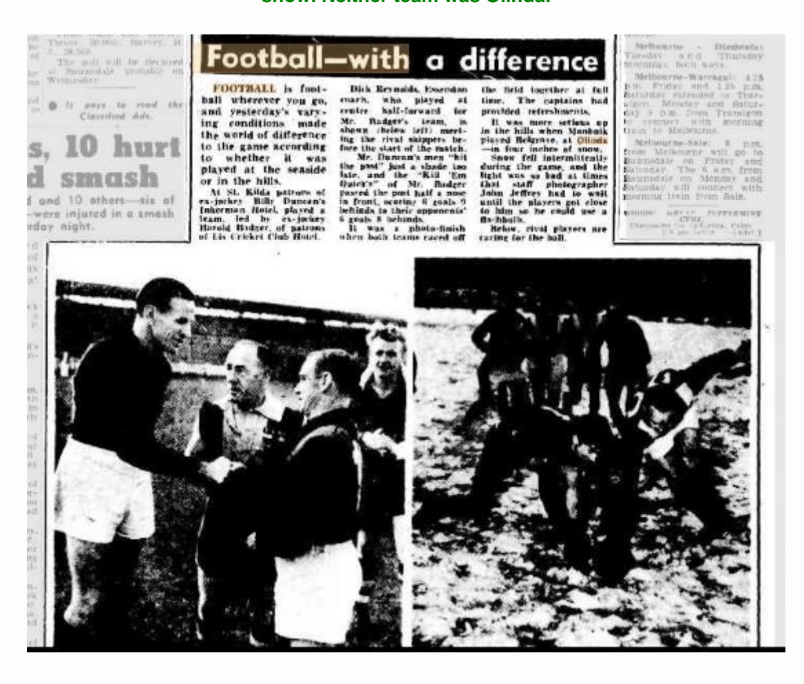
Probably our all time snow pic is this one- the ground is being marked out with a leaf blower!!

This is from The Sun newspaper in July 1952- two things stand out- firstly the amount of snow that had fallen and secondly the two teams that were playing in the snow. Neither team was Olinda.