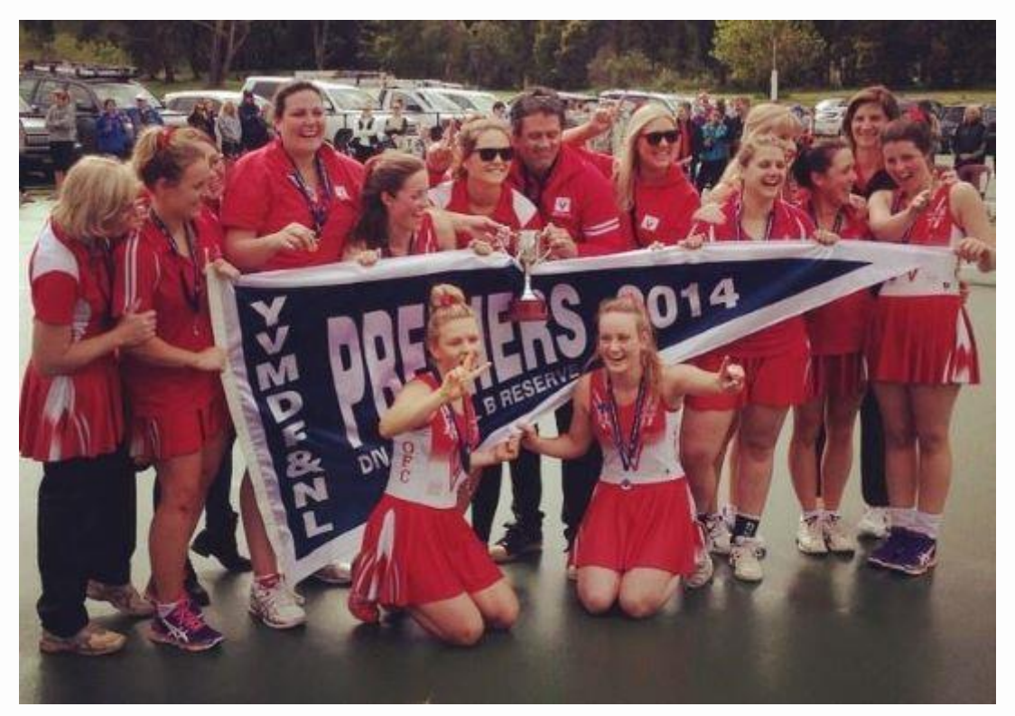
Tenth year anniversary of our first flag win- celebrations coming soon to some Social Rooms near you

To recognise the anniversary the girls are getting back together during the Wandin round (Aug 17), More about that wonderful Flag victory closer to the day.