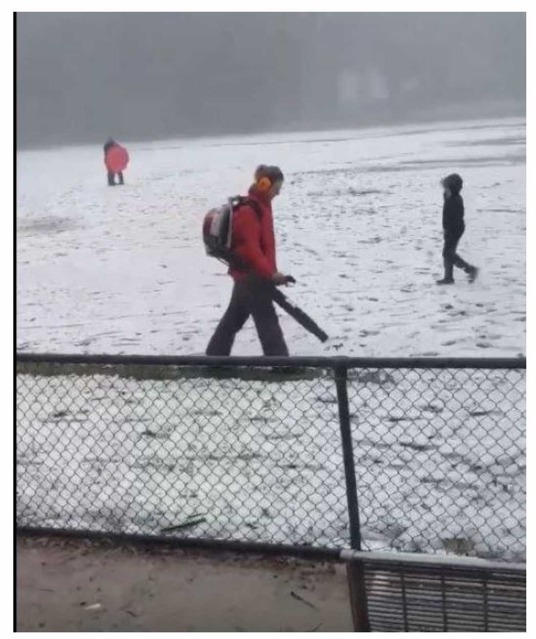
This pic is from Aug 11 2019- juniors are hosting a finals day !!! The only way to mark out the ground was with a leaf blower.