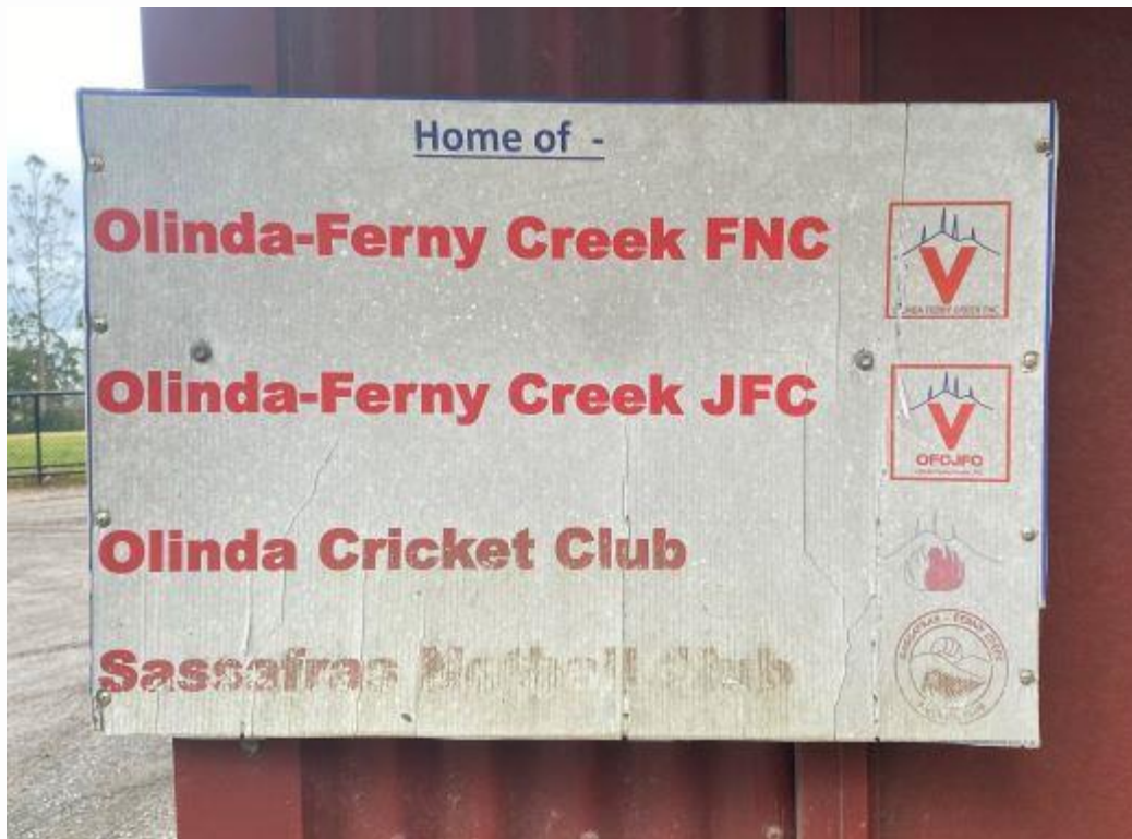
The old "stakeholder club sign" at the front gate- time to go.

One of the first steps was to replace this sign-