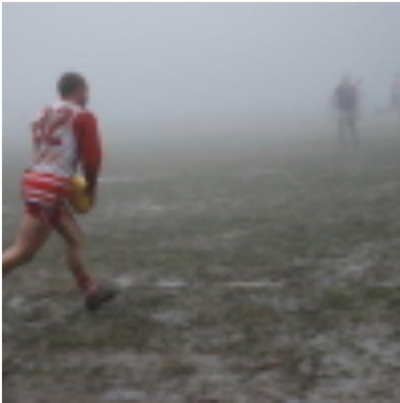
Mid July at Olinda= when the "toughest get going".

The notes ( we think they were coaching notes) warned that "July is the 'work harder and don't make excuses' month. Don't make excuses to avoid training. Don't make excuses to avoid working in the canteen. Now is the time to really lift your game and put in so it's the opposition who are the ones looking for excuses when they come to Olinda."