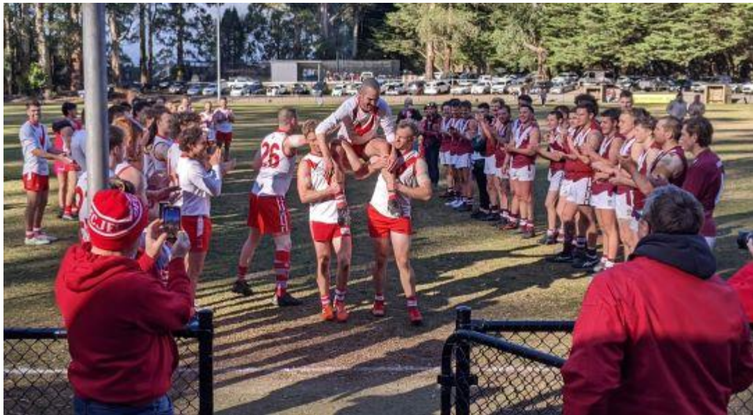
On balance it was a sensational day