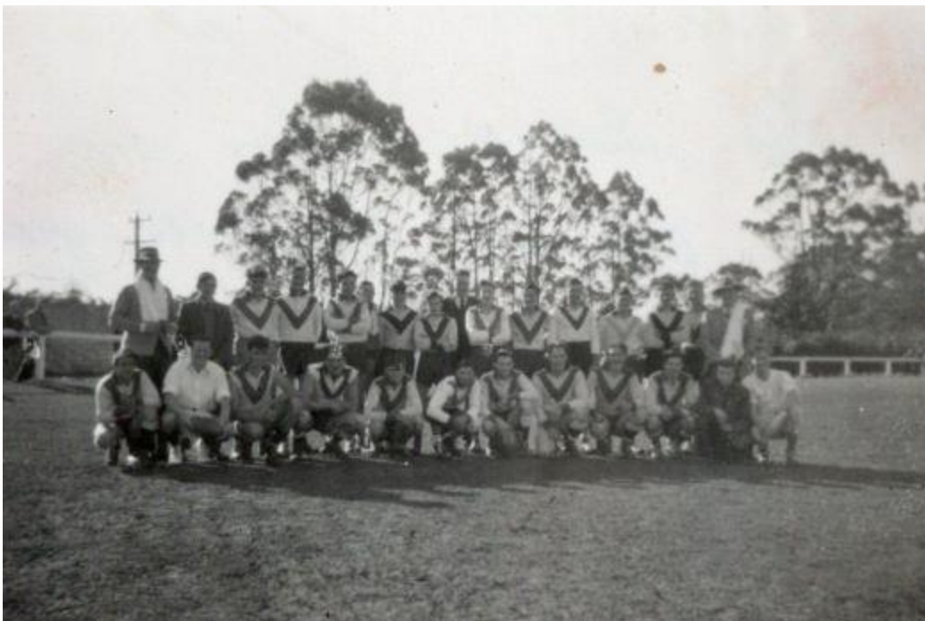
Early 1950s- the Reserves are wearing black shorts so they're playing at home. But it doesn't look like Olinda.