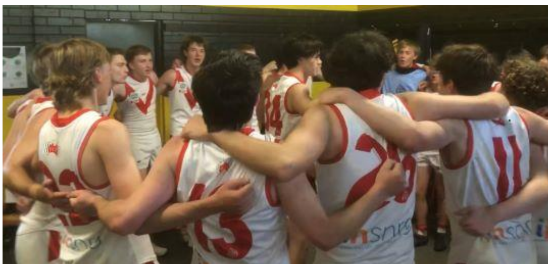
Get around them- Under 18s celebrate their big upset at Woori

While the club headed to Wandin on Saturday the kids found themselves up the road at Woori Yallock, facing a team which pummelled them by 10 goals in their last encounter Up