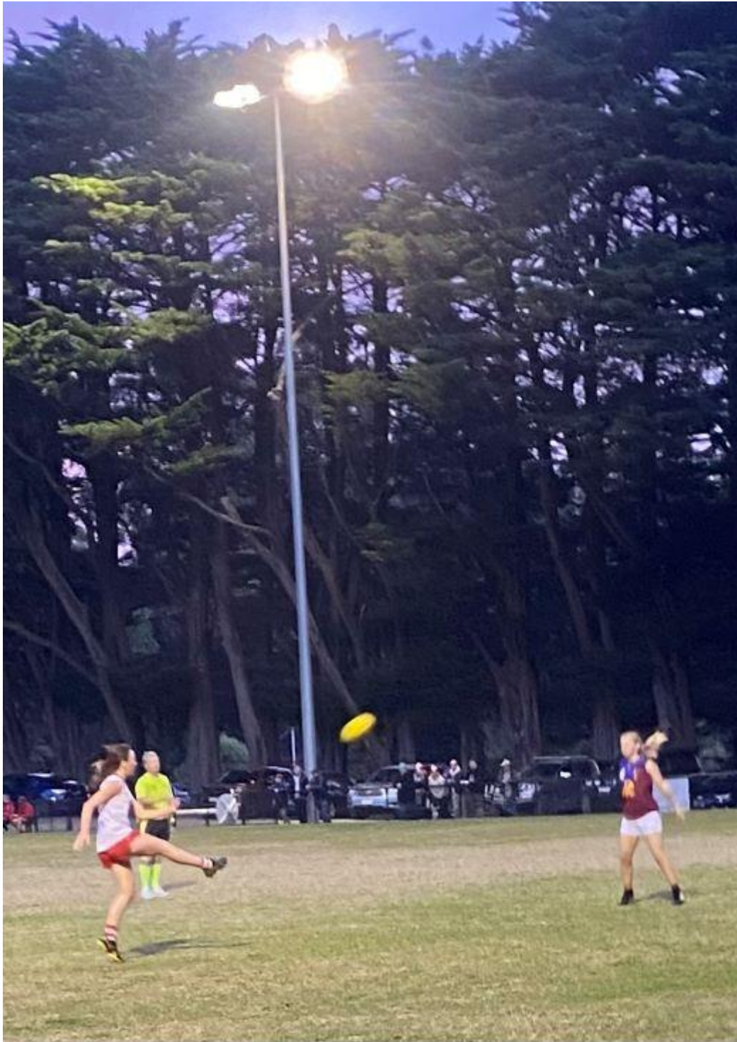
"The Weapon" kicks one of her three big goals.