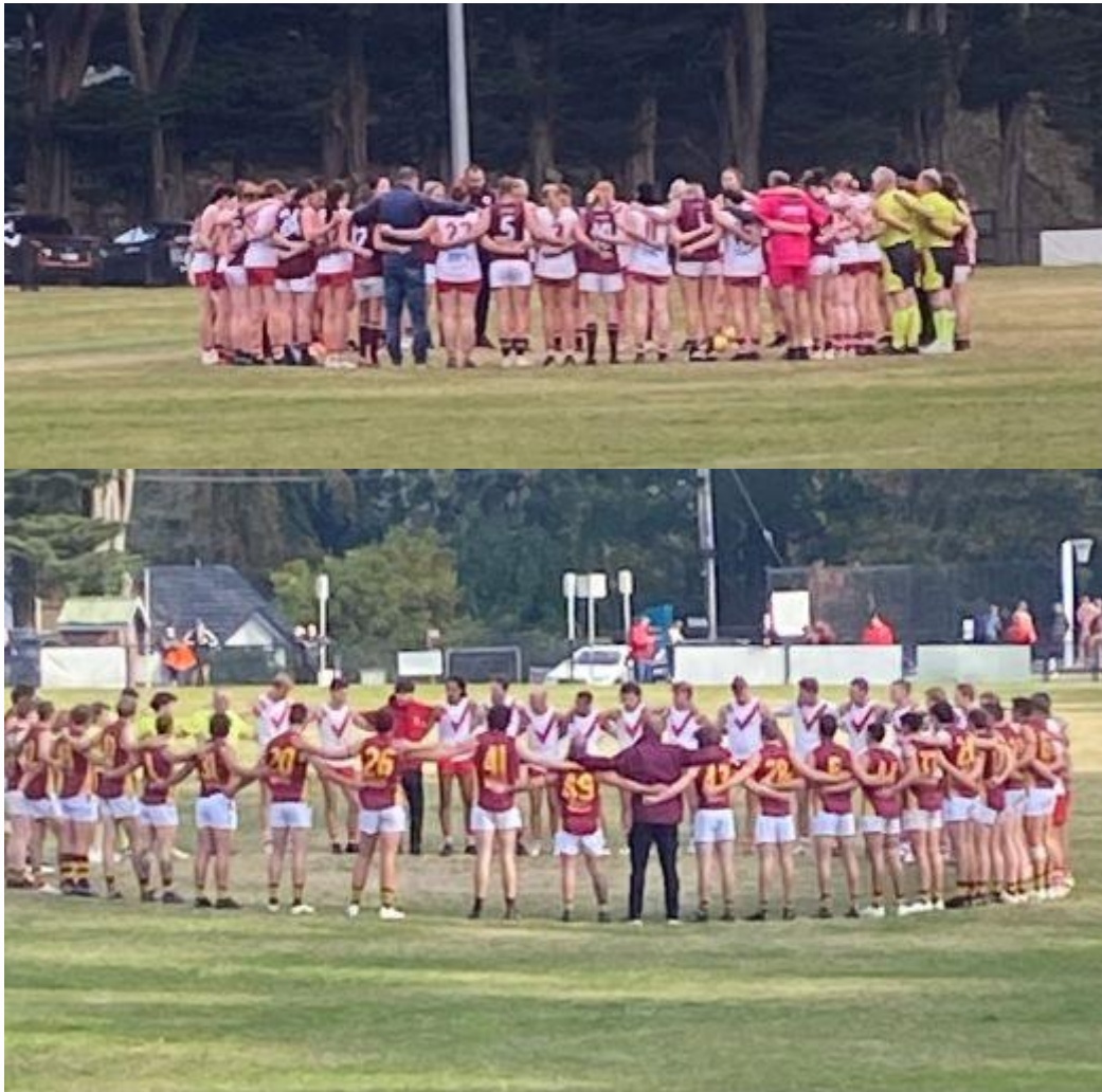
OFC, Pakenham and Monbulk players stood for a minute's silence in support of the AFL's program drawing attention to Gender Violence

OK- looking ahead-checking this week's program- as we head off in two different directions-