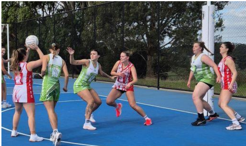
A Grade- Harper positioning herself for a clean possession inside the circle.