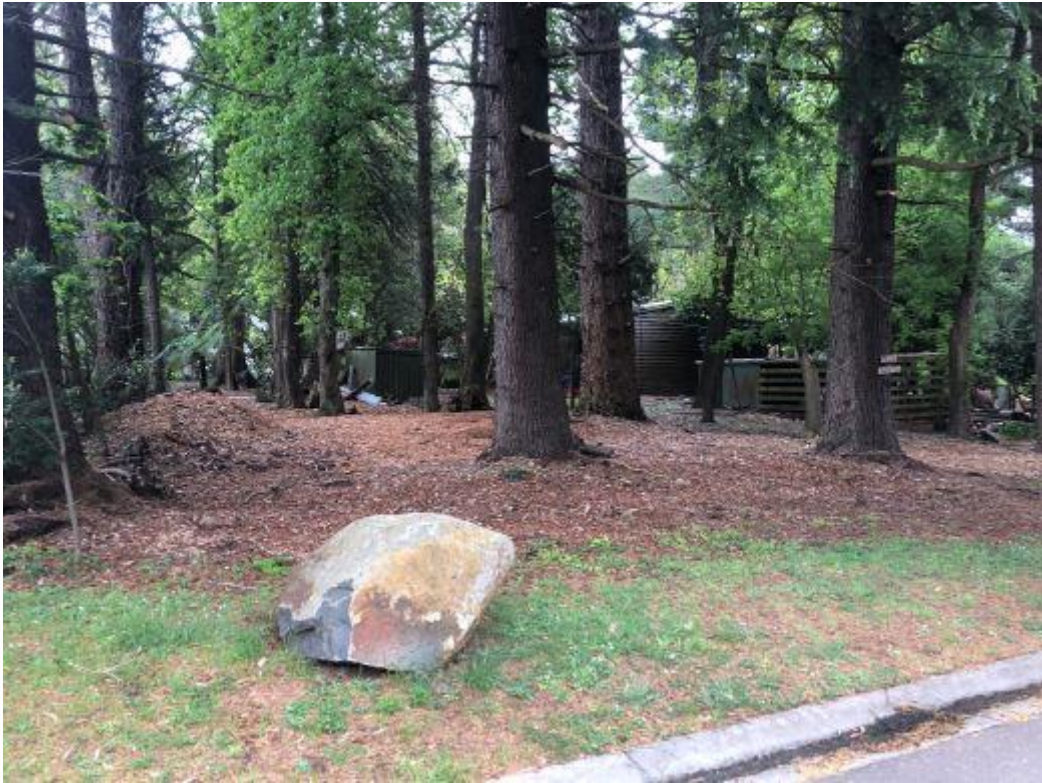
Looking towards the heritage listed original Stretton household which may have been part of the old Olinda ground.

Interestingly when Stretton purchased the property he wrote the following to Fred Mc Cubbin-