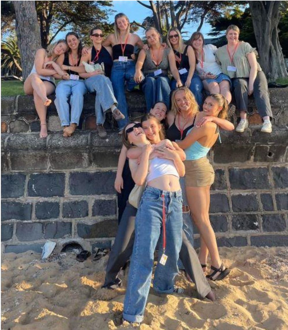
A well earned weekend away at Phillip Island for our 2023 premiers