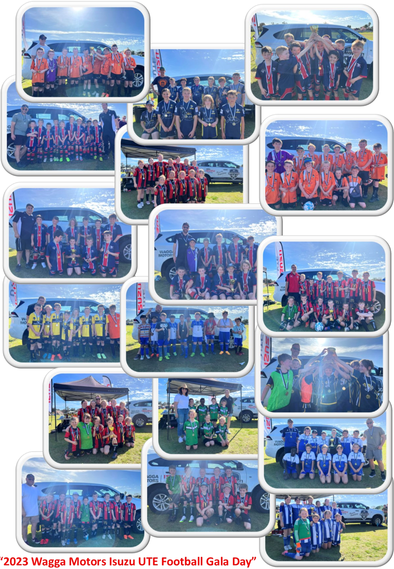
"2023 Wagga Motors Isuzu UTE Football Gala Day"