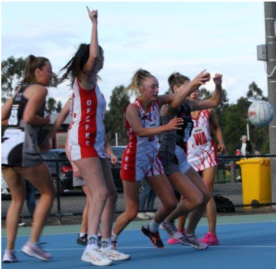
Defensive pressure after half time ensured there were no easy circle entries.

The good news is that we held them to 43 goals, their second lowest score of the season, but we could shoot only 31 ourselves, and if we are to challenge Narre during the finals we've got to find a way to score more.