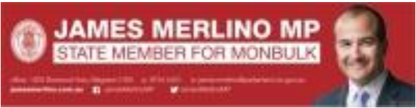
State Member for Monbulk