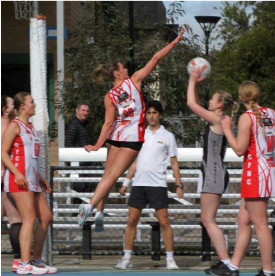
B Grade-an ideal run into the finals