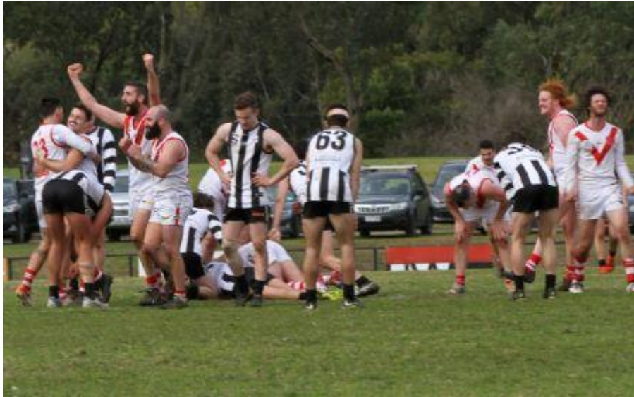
OFC inflicts the first loss for the season on Narre Warren Reserves- at Narre.