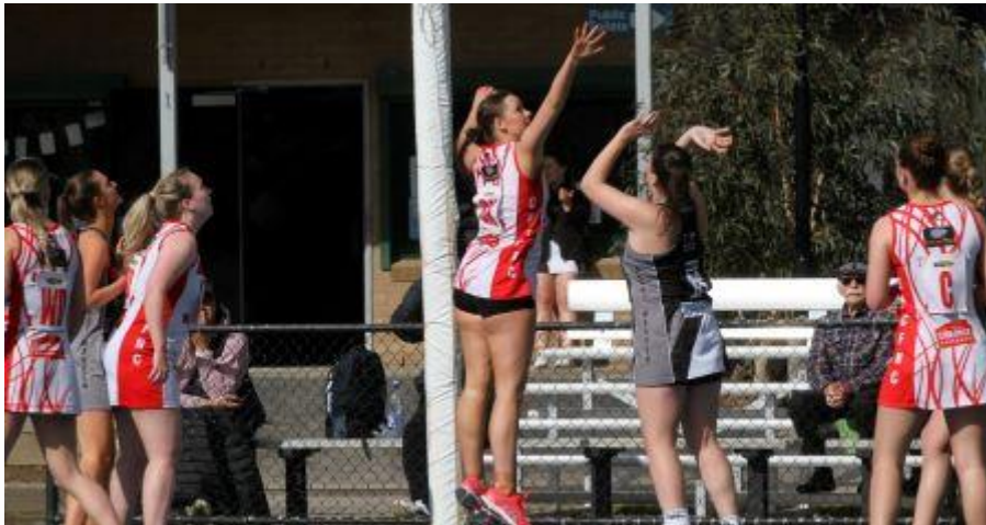
OFC inflicts the first loss for the season on Narre Warren C Grade-at Narre

Interestingly- in terms of ladder positions for all teams- OFC is probably the second most powerful Club in the competition (as we were in 2021) but the gap between ourselves and top club Narre Warren is stark.