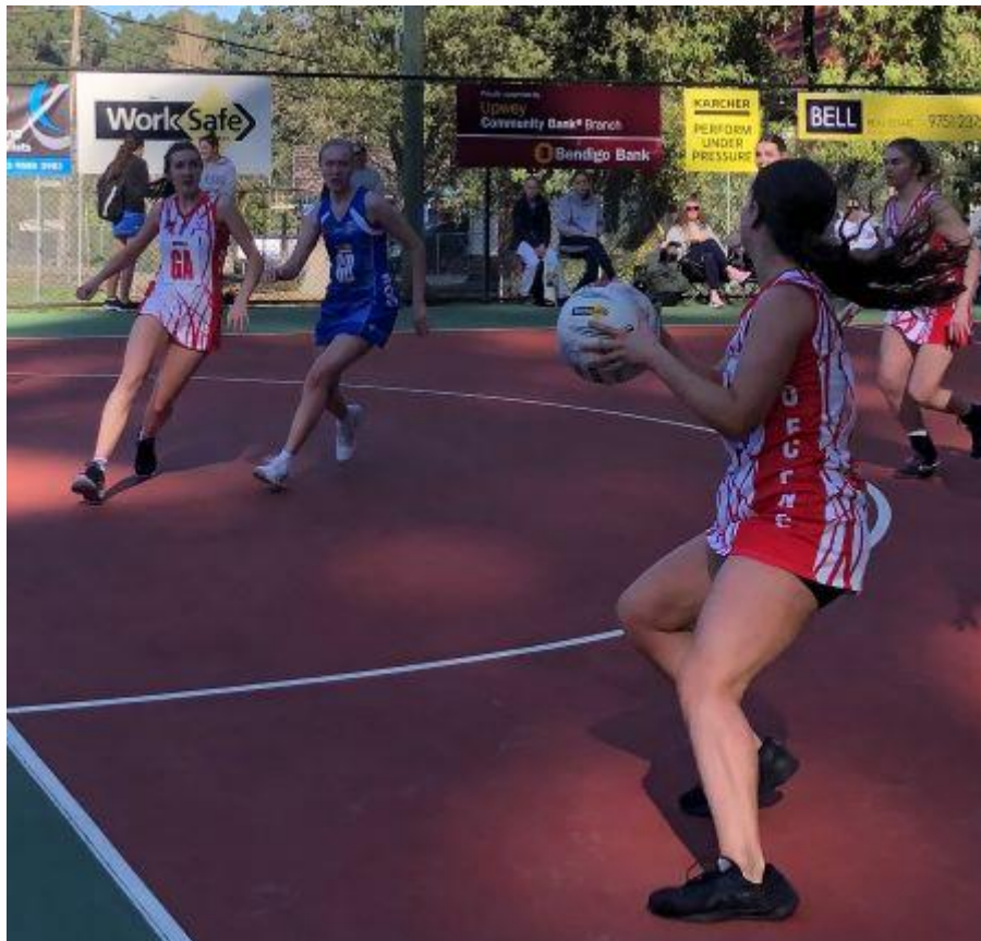
C Grade- heaps of upside for this young unbeaten team

Only two teams in this grade remain undefeated- OFC and Narre Warren. We host them this week !!