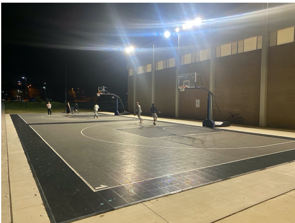
High quality competition standard 3x3 infrastructure at the University of Canberra

In 2019, the University of Canberra received $215,000 as part of the Federal Government’s Sports Infrastructure Grants Program to build five 3x3 basketball courts at its Bruce campus.