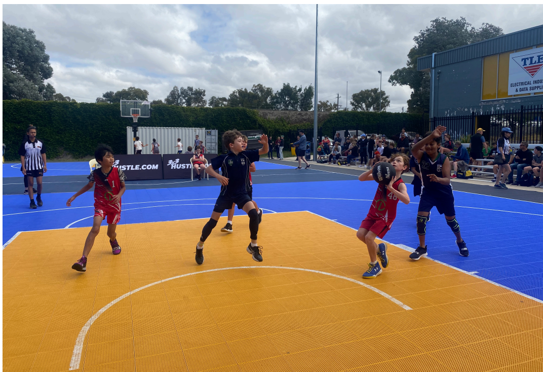
Junior Dodgers competing at a 3x3 Hustle event at Belconnen Basketball Stadium

https://www.instagram.com/p/CMefQllg5Lo/?utm_medium=share_sheet