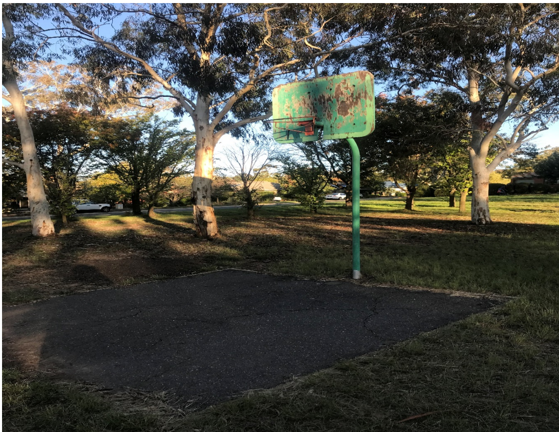
Malaga Street, Warramanga