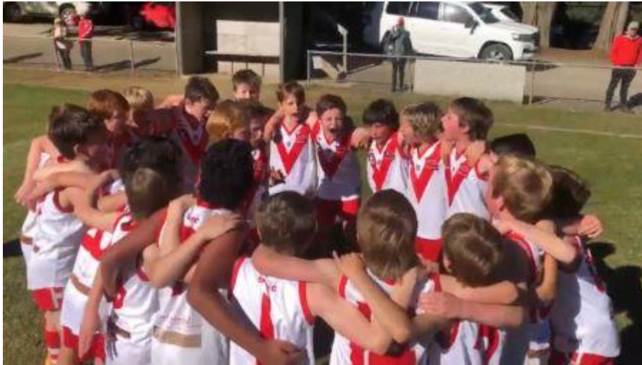
Sunny days for our unbeaten U/11 boys.