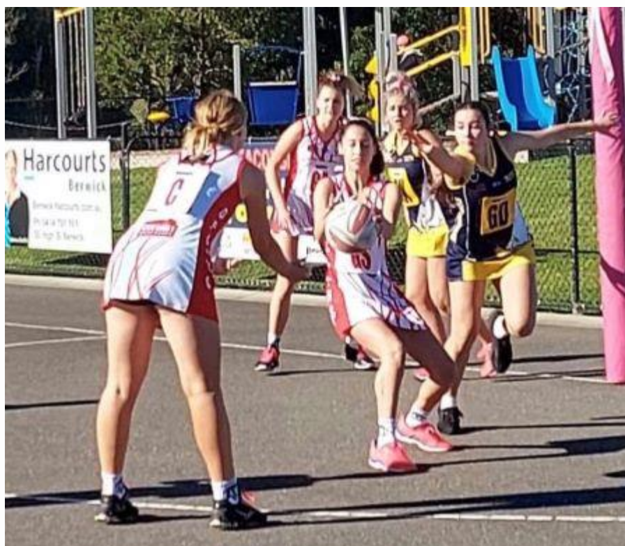
OFC U/17 girls- turning heads in AFL Outer East

Given that we are regularly playing clubs that have under age teams feeding their U/17s this is a particularly strong result (so far)