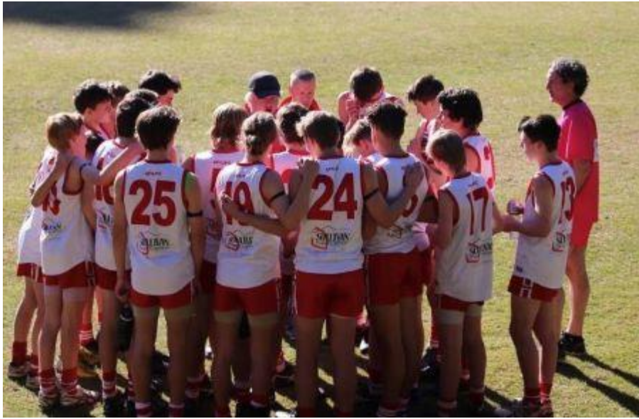
U/15s- a talented group coming through junior program

Meantime the U/13s saluted against Emerald. It's been a tough season for this group but now that the U/13s have been regraded things could open up for them.