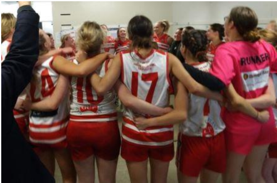
OFC women celebrate their best win so far.

The girls came into our return match against Belgrave (at Beacy) having learnt a lot from playing Yarra Junction the week before in really difficult conditions. We worked on our midfield clearance setup, our defensive structures and continued to work on our ball use and running efforts during training this week. Our game this week would show us how far we've come, especially given that we expected a stronger Belgrave side than we faced in Round 1