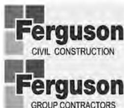
Ferguson Civil Construction