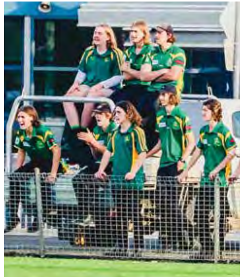
Parrot's juniors watch as the seniors claimed a big win over Drouin.