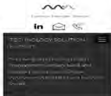
McArthur and Associates