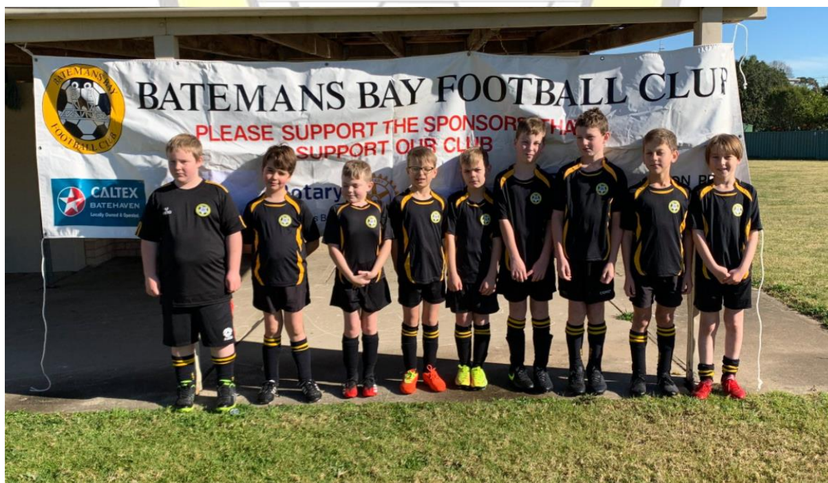
U9 Caltex Batehaven Bay Strikers in front of the BBFC Banner.