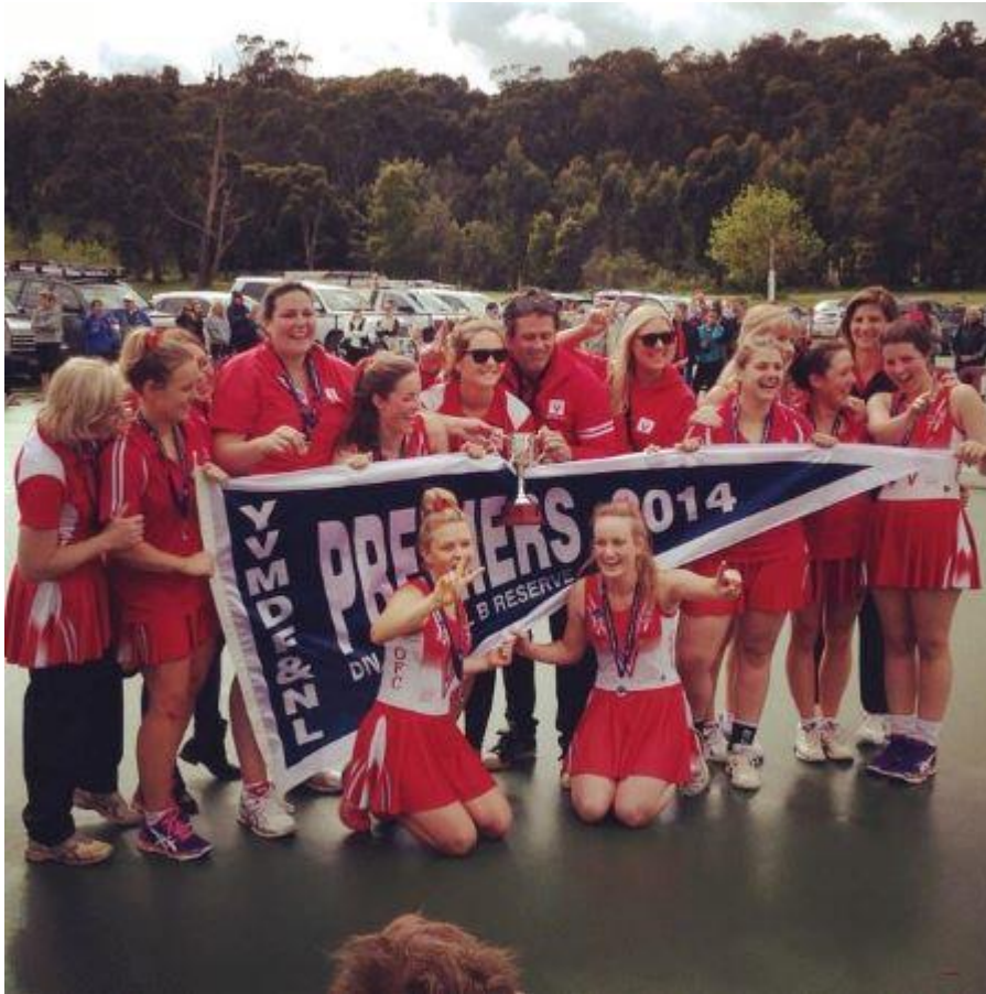
2014 Premiers- our breakthrough year.

OFC won three football premierships in 2009 followed by U/18 flags in 2010 and 2013.