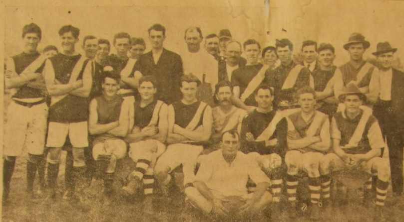
EMERALD FOOTBALL TEAM