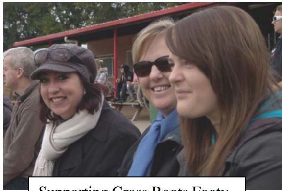
Supporting Grass Roots Footy