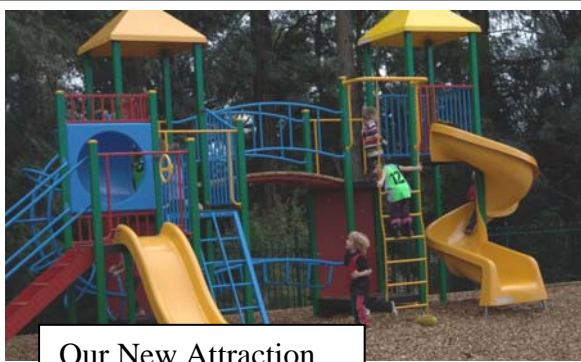
Our New Attraction