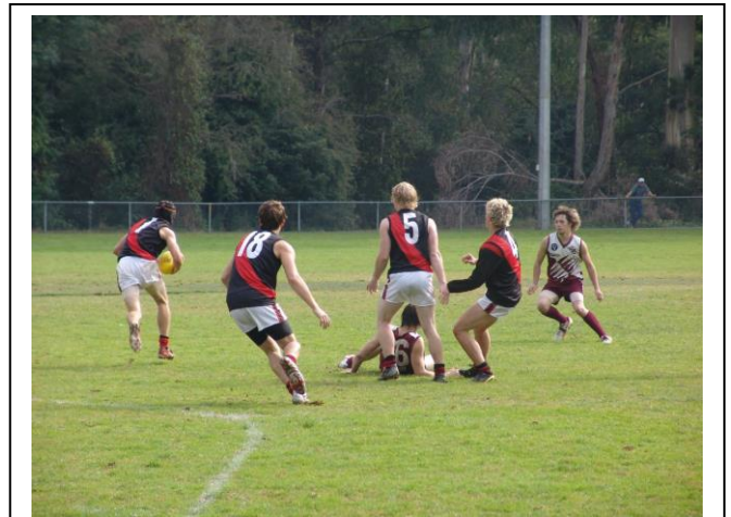
The Emerald boys leaving Mt Evelyn flat on the ground.