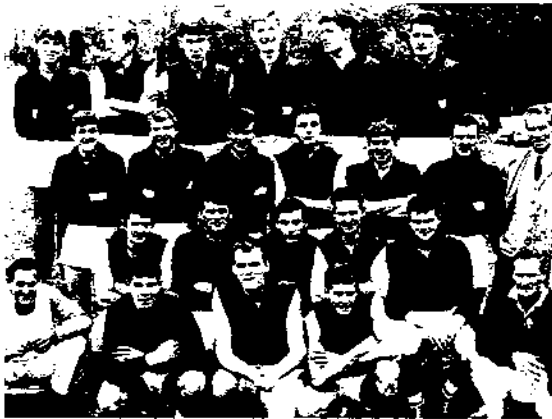
Emerald Football Team 1965

There was a move this year to change the Under 16 to Under 17, but it was defeated. This same year a possible football merger was discussed between Club Delegates from M.D.F.A. and Y.V.F.L.