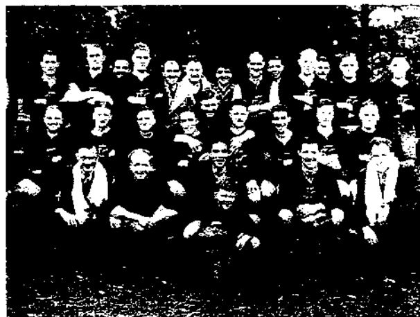
Emerald Football Team 1946

We defeated Upwey-Tecoma 13.13 to Emerald 16.17 in the second Semi Final, and again in the Grand Final 15.15 to 8.7.