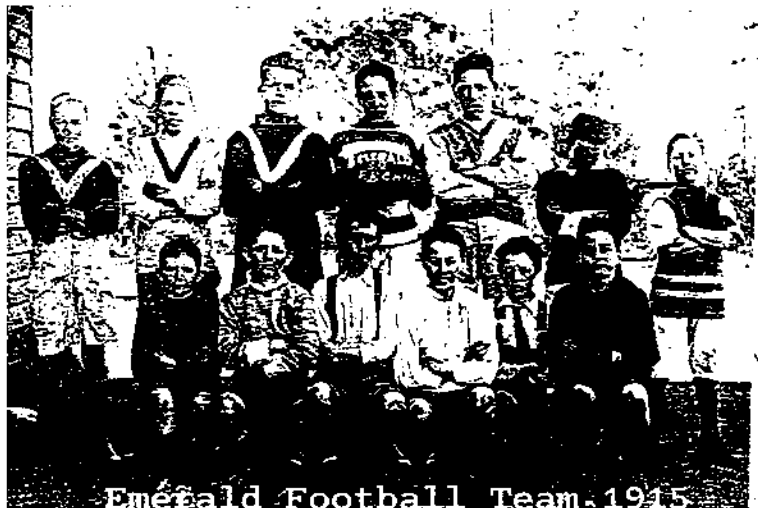
Emerald Football Team 1915

Knickers were worn 3"-4" below the knee, as anything shorter would have been considered indelicate.