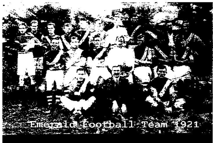
Emerald Football Team 1921

A game of football in those days was quite an event. The ladies brought picnic hampers and everyone enjoyed a social cup of tea at half time. This was particularly enjoyed by the players,