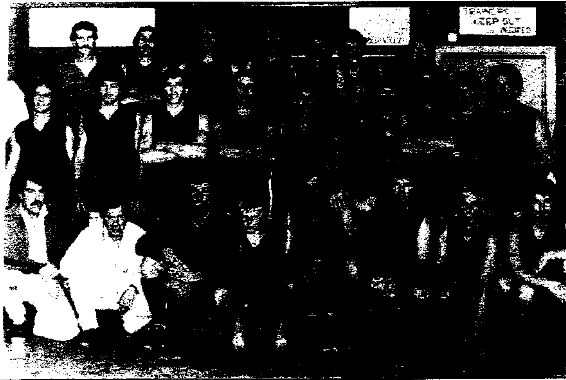
1981 Senior Grand Final Premiers Team

Our Red and Black magazine commenced publication. (A tradition that has now continued for 23 years.)