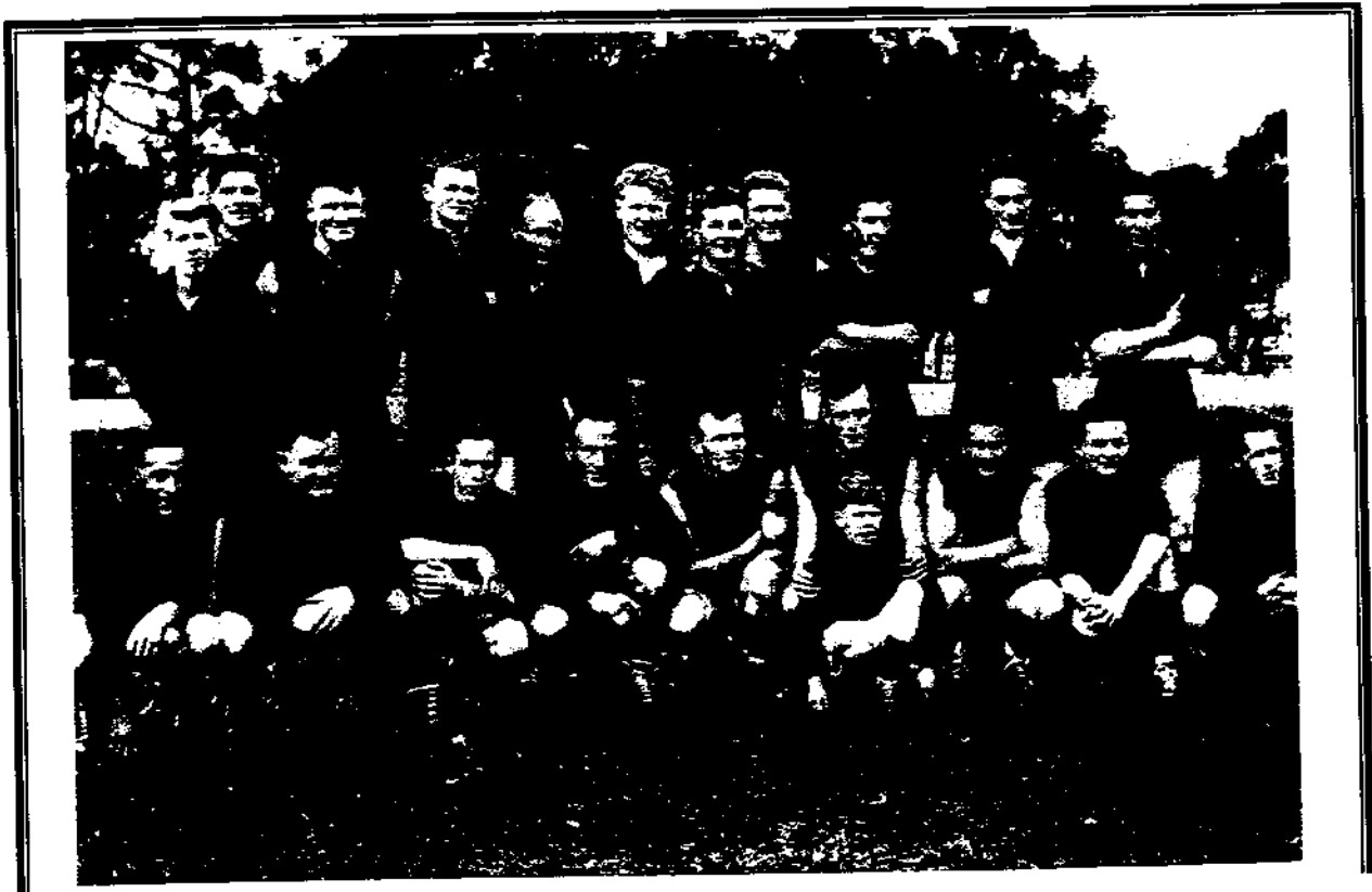
EMERALD FOOTBALL CLUB SENIORS - PREMIERS - 1955