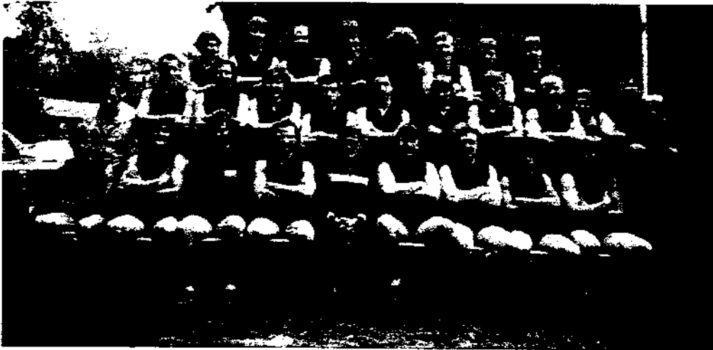
1983 Reserves Grand Final Premiers Team