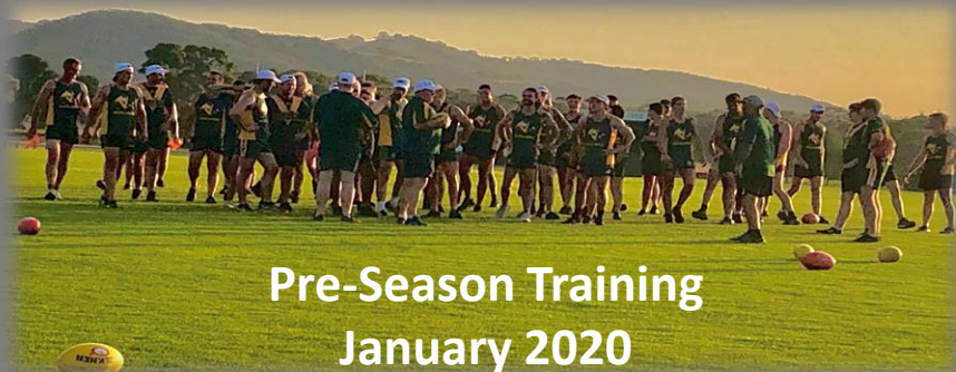
Pre-Season Training January 2020

we had the footballs out first night as the majority of the group were fit and ready to commit to skills and structures. January to March was very encouraging with large numbers at trainings, buy in by the group to the structures and game plan plus a very successful recruitment period adding size, skill and leadership to the club. The players have accepted the technology being introduced to the group with GPS units now in use at every training (thank you to the Club for your kind gesture to buy some GPS units), flying a drone behind the goals to review ball movement at training and posting the videos on Facebook and use of video footage to review game strategy and structures.