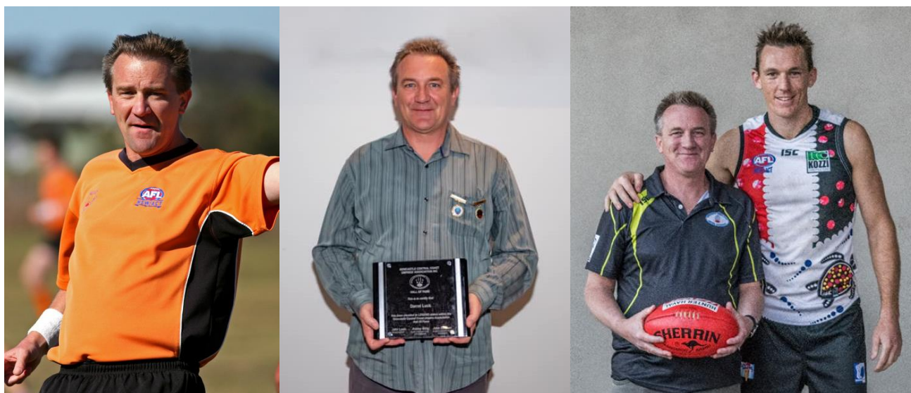
2019 Hall of Fame LEGEND Darrel Luck