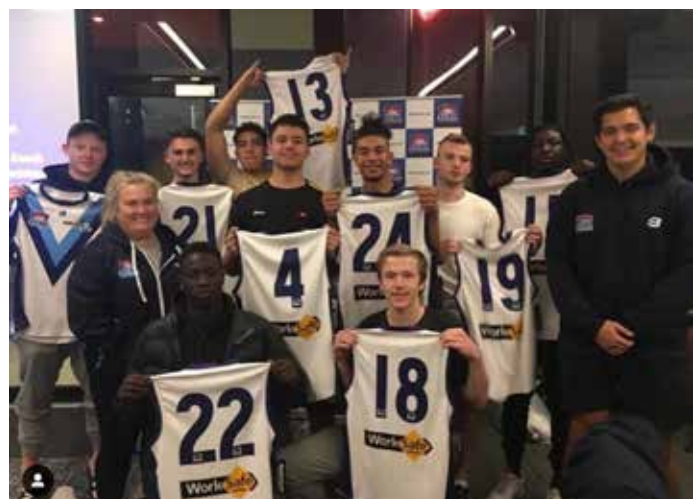
STKC Interleague Reps