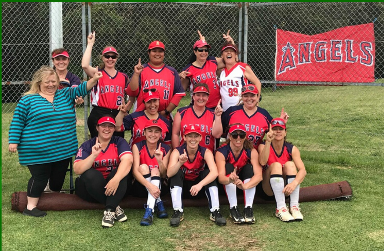
Photo taken on Saturday 19 October against the Wildcats. Angels won 18 to 5.