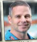
Brad Hodge Australian Cricketer