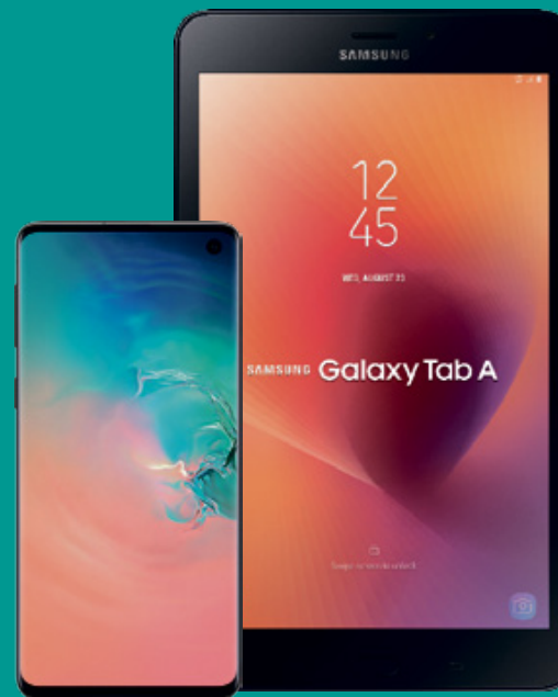
SAMSUNG Galaxy S10