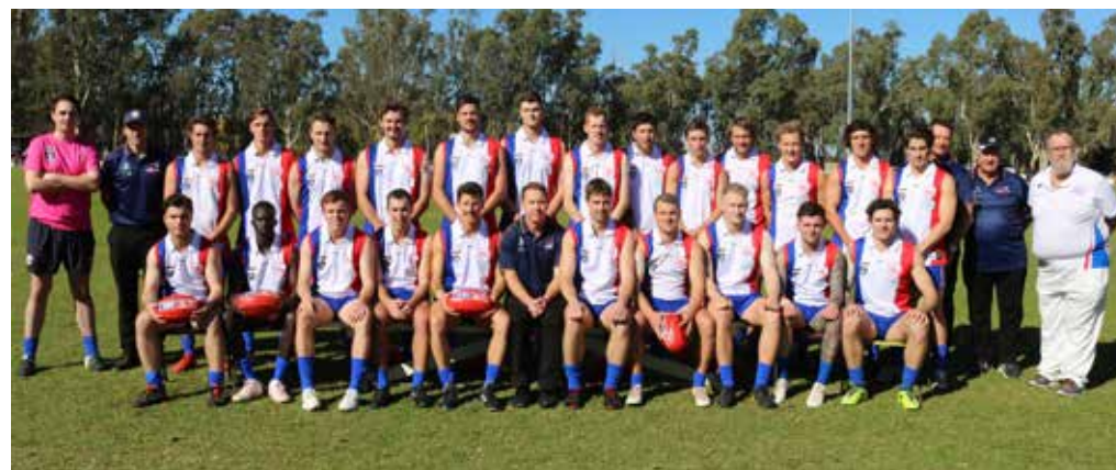
2019 TRFM Gippsland League Community Championships squad

*Players marked in bold received the AFL Victoria best on ground medals