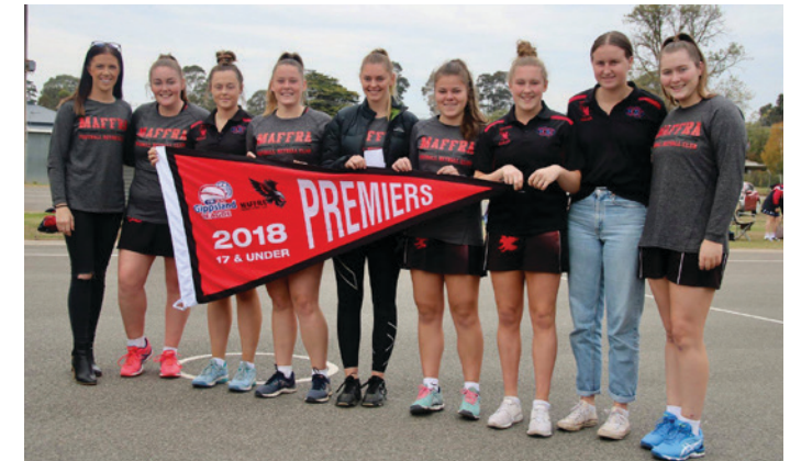
Maffra's 17 & Under side unfurled their premiership flag at home in round 2.