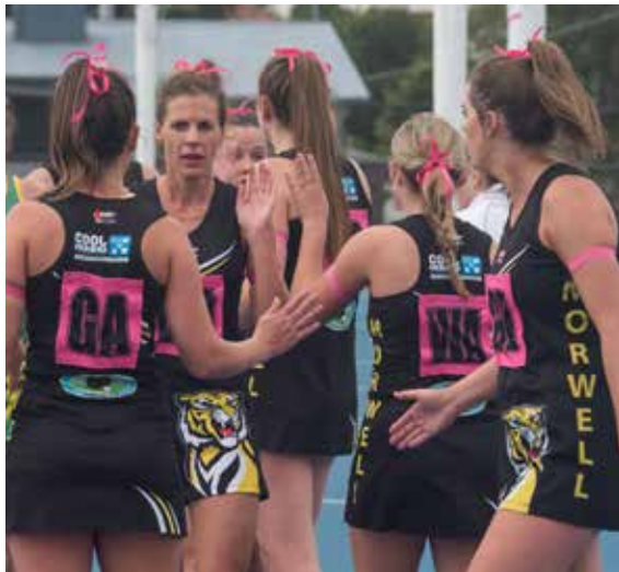
Morwell A Grade are all smiles at this point, sitting undefeated on top of the ladder.