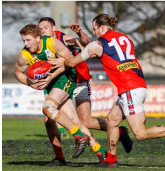
Leongatha (5th) and Bairnsdale (6th) look set to battle it out for a finals spot towards the end of the season.