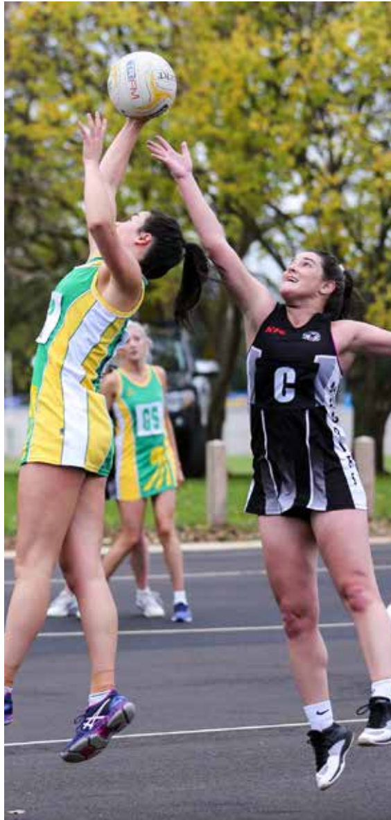
Leongatha have made the move outdoors in 2019 with their new courts being used from the start of the season