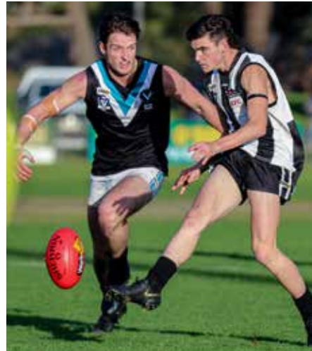
Sale's younger brigade have continued to develop and see them sit clear at the top of the Senior ladder.

Your local builder, supporting local footy & netball for over 5 years.