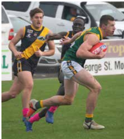
Morwell and Leongatha played a Pink ribbon game in round 5 to support breast cancer awareness