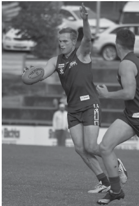
Former AFL star Bernie Vince has been a welcomed edition to the Lions line-up this season.