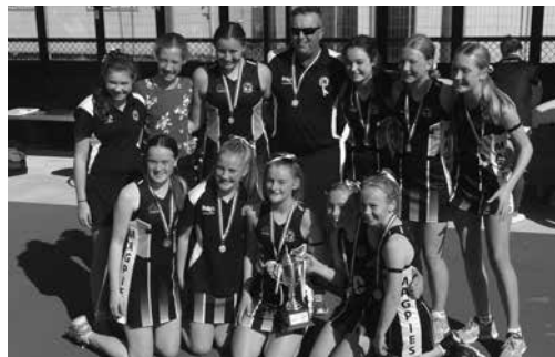
13 & UNDER PREMIERS - SALE Sale 46 def Leongatha 10