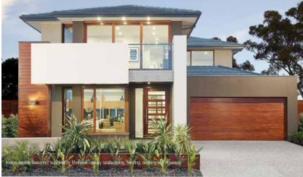
Image depicts features not supplied by Mettricon. Landscaping, fencing, decking and driveway.

At Mettricon, we don't only support the local Gippsland community, we help build it. Come and visit a display today, and find out how you too, can truly love where you live.