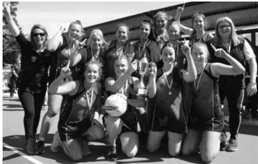
C GRADE PREMIERS - MAFFRA Maffra 39 def Traralgon 38