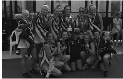
B GRADE PREMIERS - Traralgon Traralgon 46 def Moe 40