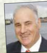
Sam Kekovich Sports commentator