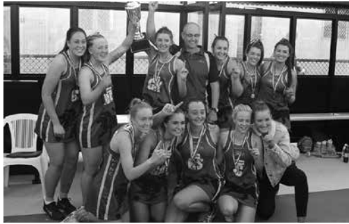
A GRADE PREMIERS - MOE Traralgon 50 def by Moe 52