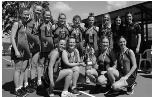
17 & UNDER PREMIERS - MAFFRA Traralgon 35 def by Maffra 43