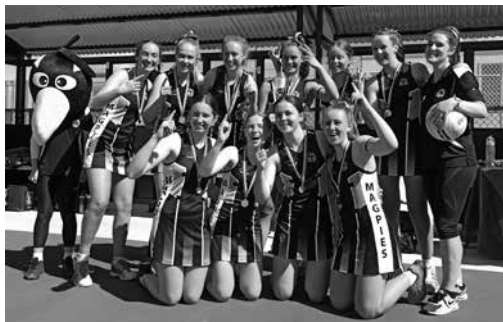
15 & UNDER PREMIERS - SALE Sale 33 def Bairnsdale FNC 21