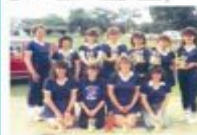
1997 A Grade Premiers