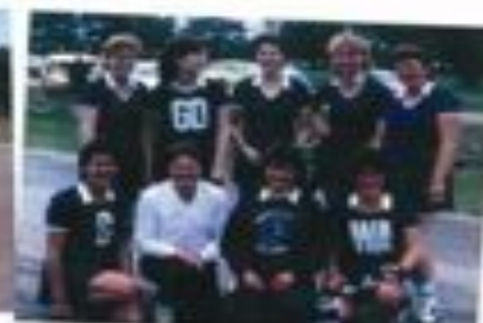
1996 A Grade Premiers