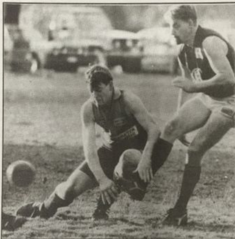
Action from last week's Greta-Moyhu match. The Blues are favored to notch another victory tomorrow.