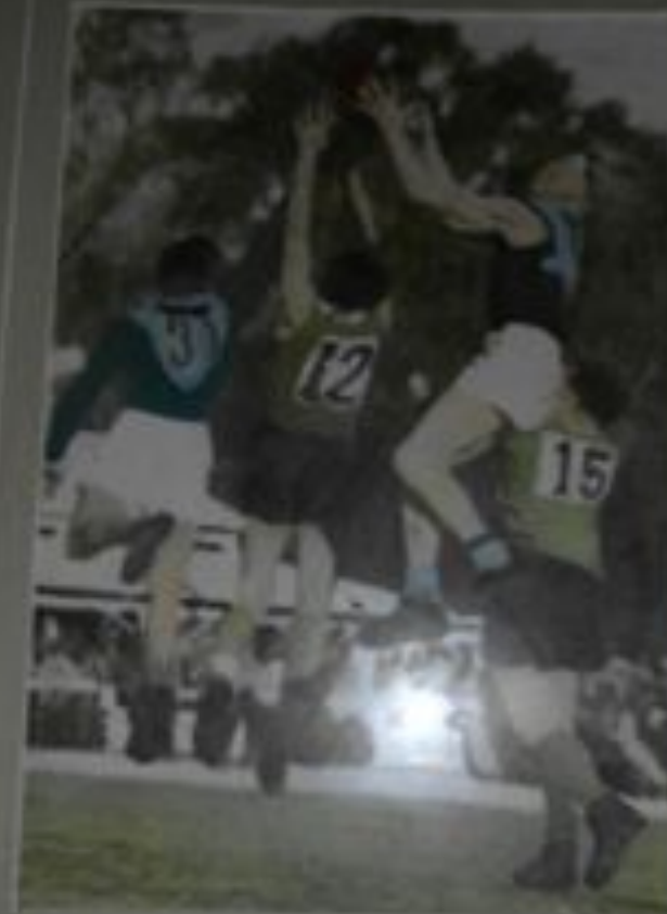
Lenel Palace O&K Preliminary Final Greta Vs Moyhu 1947