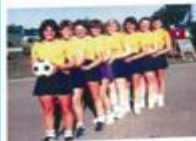
1995 A Grade Premiers