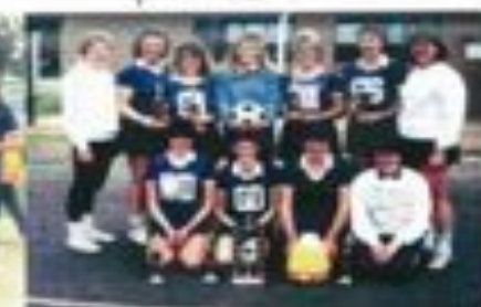
1998 A Grade Premiers