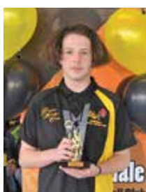
BEST AND FAIREST RUNNER UP