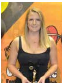
BEST AND FAIREST RUNNER UP