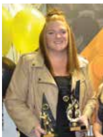
BEST AND FAIREST & COACHES AWARD