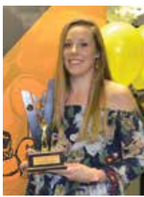
BEST AND FAIREST RUNNER UP