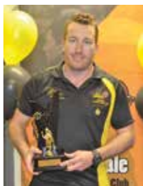
BEST AND FAIREST RUNNER UP