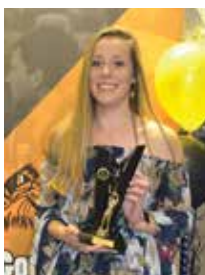
BEST AND FAIREST RUNNER UP