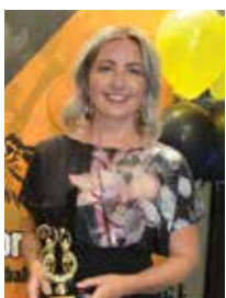
BEST AND FAIREST