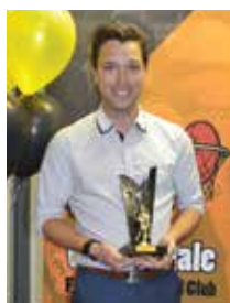
BEST AND FAIREST RUNNER UP & COACHES AWARD