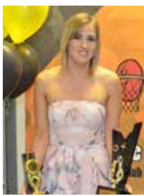
BEST AND FAIREST & MOST CONSISTENT