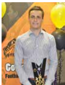
BEST AND FAIREST