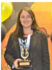
BEST AND FAIREST