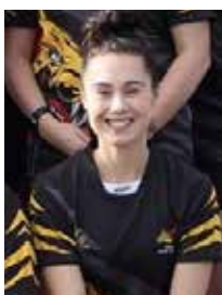
BEST AND FAIREST RUNNER UP