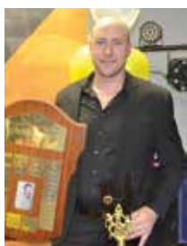
BEST AND FAIREST