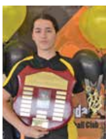
BEST AND FAIREST