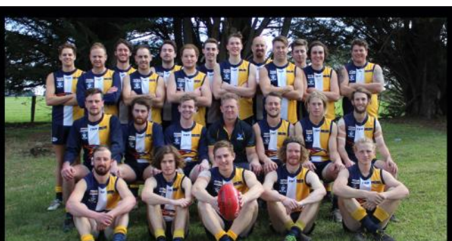
Western Eagles Football Netball Club