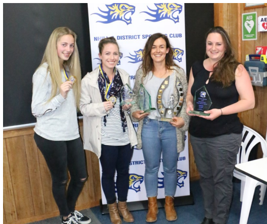
Left And Below Women's and Open Competition award winners for the NDSC Hockey Division