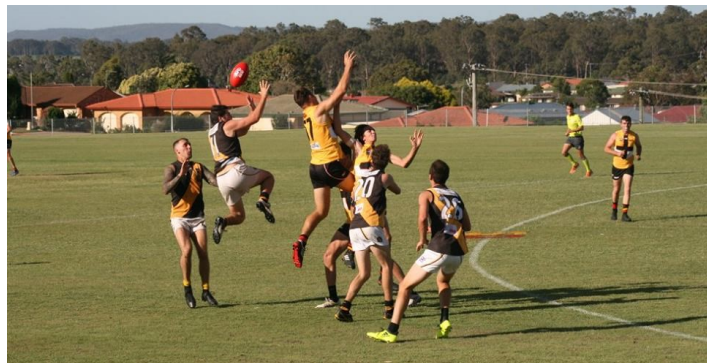
Round 3 - 20-21 April 2018

HUNTER HAVAL HAVAL Have it all. MAITLAND & CARDIFF