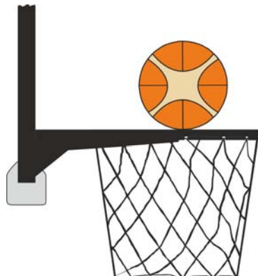
Diagram 2 Ball in contact with the ring