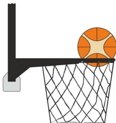
Diagram 3 Ball is within the basket

31-21 Statement. It is an interference violation if a defensive player touches the ball while the ball is within the basket.