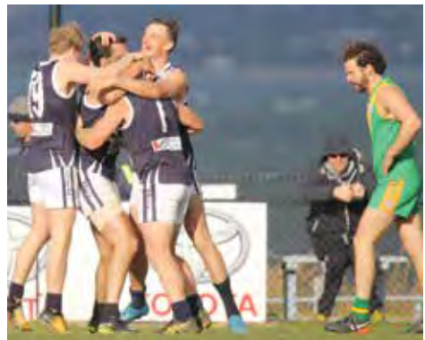
Hoppers Crossing defeated Spotswood in last week's Division 1 Semi Final 1.

The preliminary final will also be at Burbank Oval, a venue the Warriors have played at the past two weeks. A win will give them a chance to earn redemption for last year's grand final defeat.