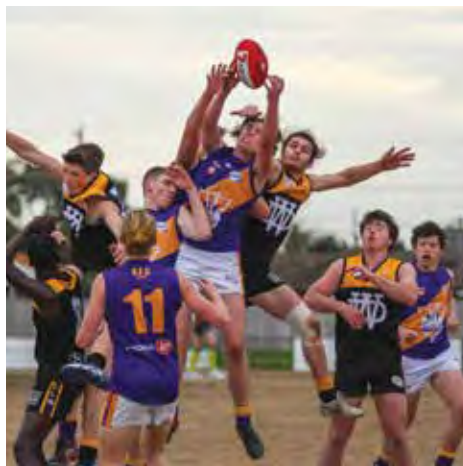
Werribee Districts are through to the Under 19 Grand Final after defeating Altona in the Second Semi Final.

Altona will take on Yarraville this Saturday in the Preliminary Final with the winner versing the Werribee Districts for the ultimate prize.