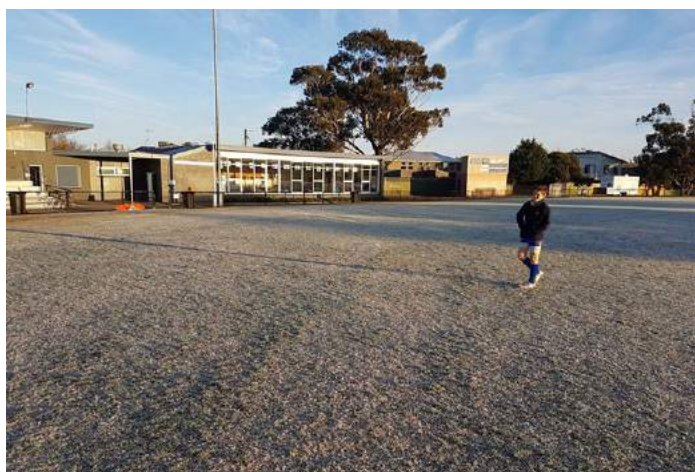
Luke Healy U12 checking out the ice rink!