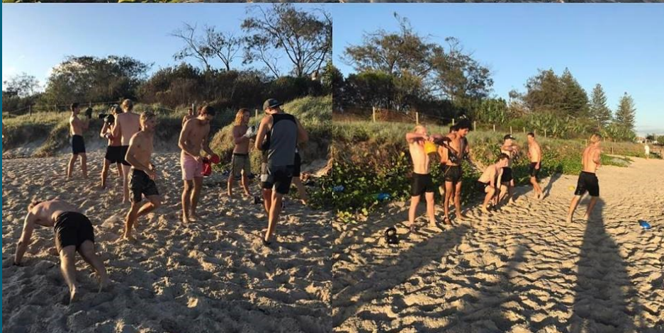
Beach Session at Byron Bay