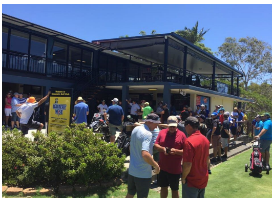
2017 Annual Golf Day