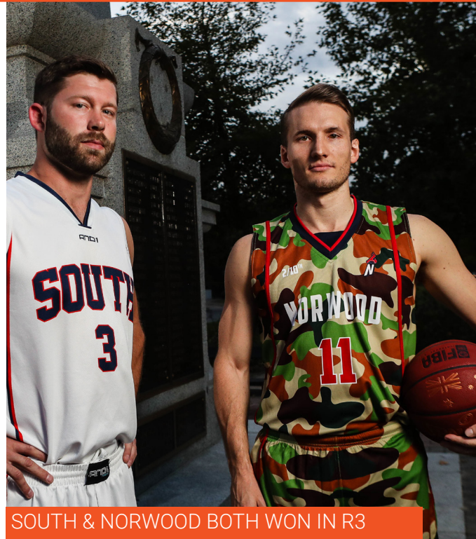
SOUTH & NORWOOD BOTH WON IN R3