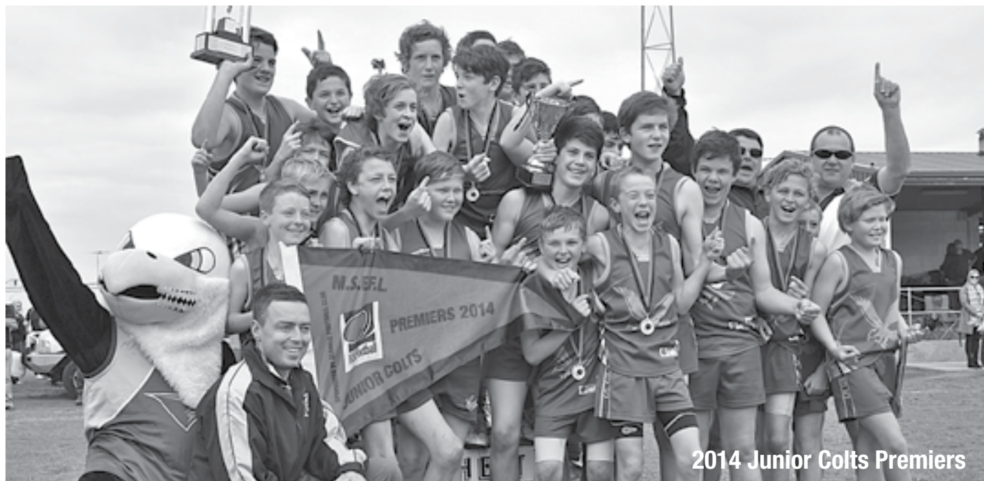
2014 Junior Colts Premiers

Some major player losses but we also have gained some great new talent to boost our sides.