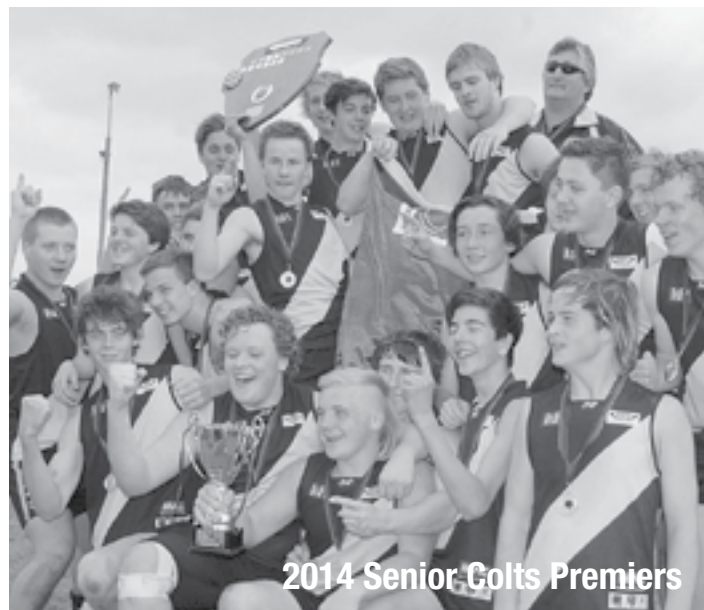
2014 Senior Colts Premiers