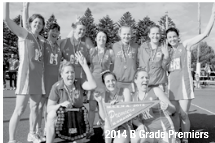
2014 B Grade Premiers