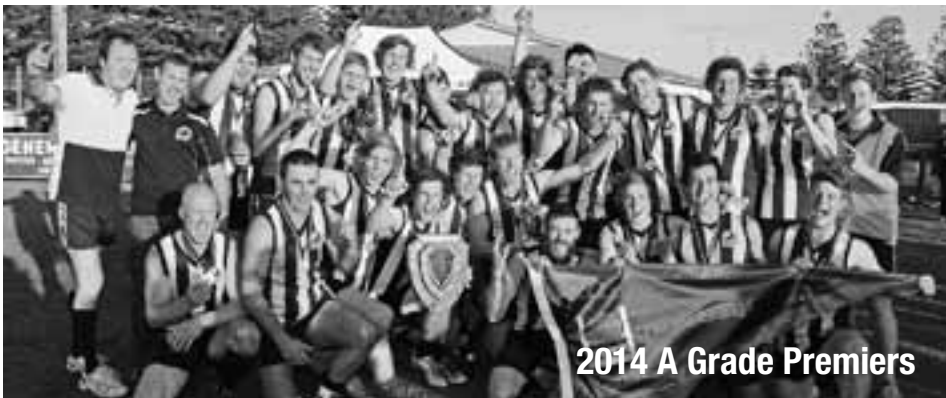
2014 A Grade Premiers