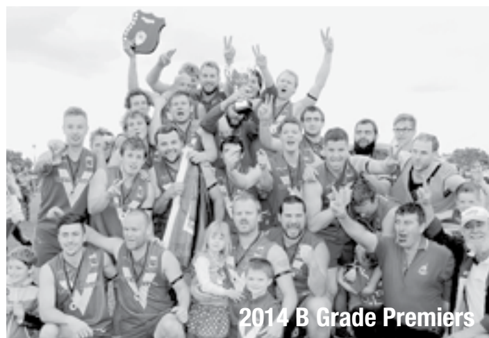
2014 B Grade Premiers